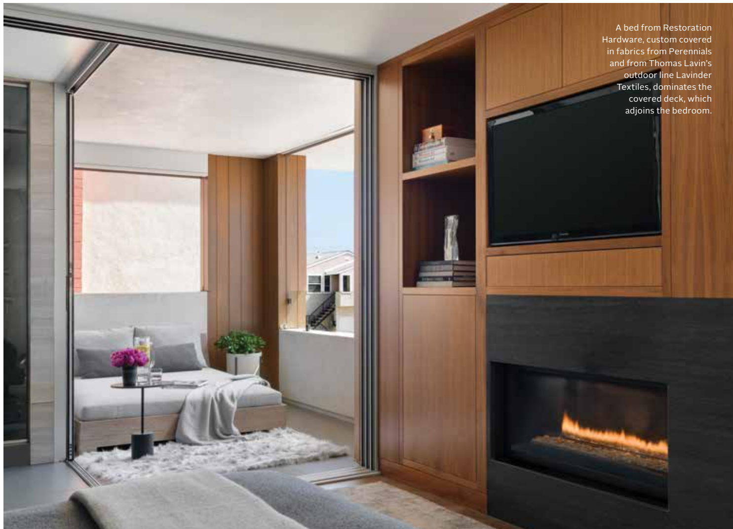
A bed from Restoration Hardware, custom covered in fabrics from Perennials and from Thomas Lavin's outdoor line Lavender Textiles, dominates the covered deck, which adjoins the bedroom.