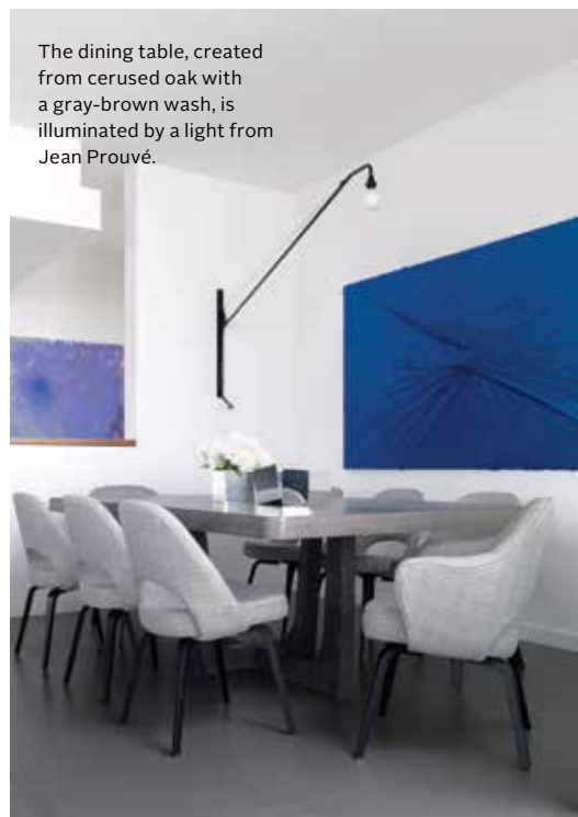
The dining table, created from cerused oak with a gray-brown wash, is illuminated by a light from Jean Prouvé.