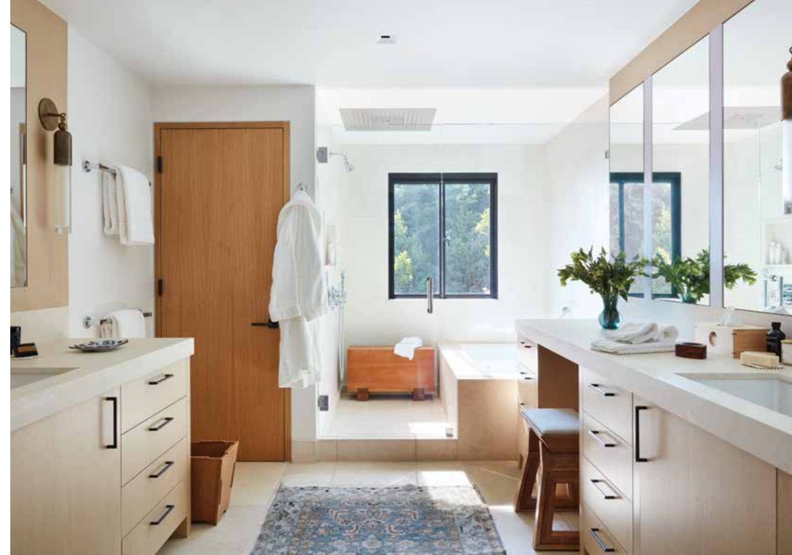
ABOVE: The materials used in both the master bathroom and the kitchen, including the white rift oak used for the cabinets and the polished chrome fixtures, bring a feeling of unity to the home and add to its feeling of expansiveness. BELOW: In a powder room, a handmade bronze sink, set in a custom reclaimed wood vanity, is one of a few pieces sprinkled throughout the house that Gordon found in San Miguel del Allende.