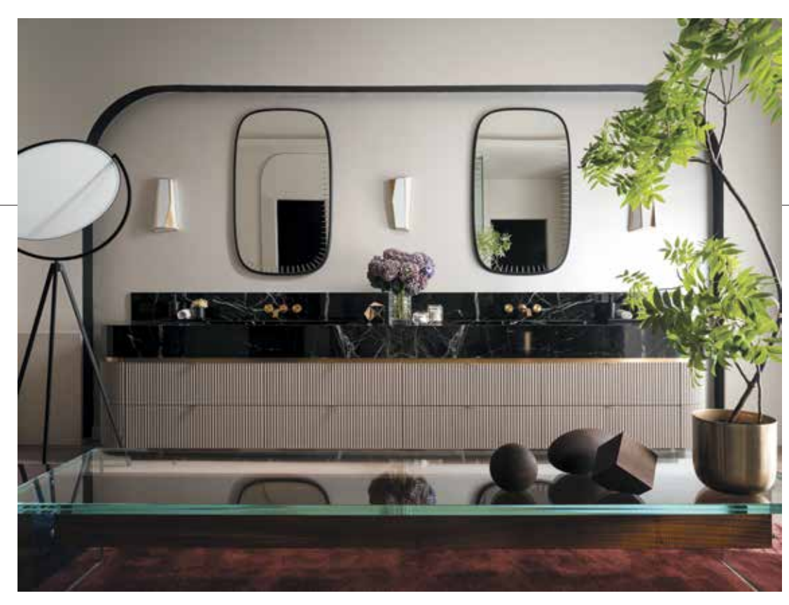
ABOVE: The custom vanity features fixtures by Kohler with custom sconces by Neptune Glassworks above. BELOW: A wall and bench of rich green Verde Levanto marble interrupts a generous shower stall of pale Perlato marble. The brass shower system, which includes overhead and handheld showers, is by Kohler.

Unforeseen circumstances truncated her timeline. "Instead of eight weeks, I had a week and a half," she shares. Sulaiman adapted. She scrapped the idea of a marblecovered floor and settled on white oak. "I actually love a wooden floor in a bathroom," she says. "It feels soft underfoot and warms the room." To fill the center of the space she conjured up a long table and a plush oval maroon rug. Then, a piece of Perlato marble earmarked for a shower wall broke. Fortunately, an extra piece of Verde Levanto was found; used for one of the shower's walls and its bench, it links tub, vanity and shower in one cohesive whole. The final effect is of a serene, inviting sanctuary that turns a practical room into a pure pleasure palace. "When things go wrong, it often forces a better solution," Sulaiman says. And, in this case, an award-winning result.