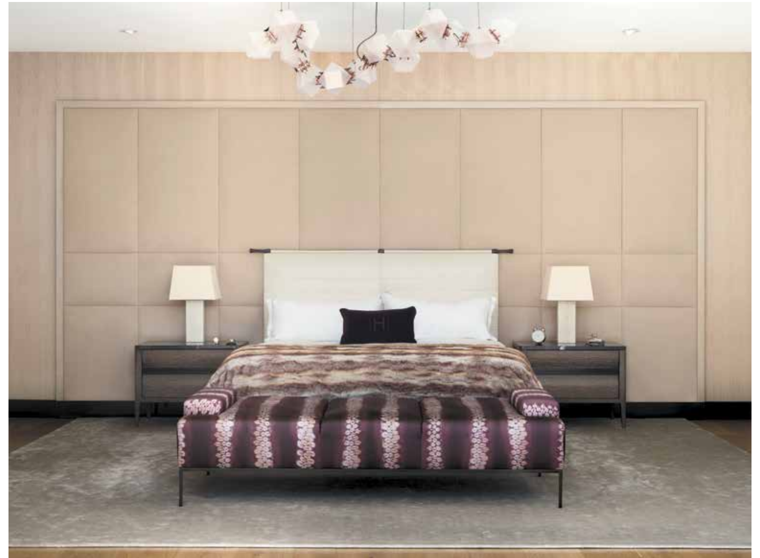
Against a Sycamore wall treatment inset with ultrasuede panels are shagreen table lamps from De Nacre et d'Orient, nightstands by Holly Hunt and bespoke linens via Vivre Luxe. The chandelier is by Gabriel Scott.

dye, a pair of voluptuous vintage brass lamps and a cluster of tables in penn shell, straw marquetry and shagreen. Confirming the interior's rapport with the outdoors, the pair designed a double-sided sofa. "It sets up the space for entertaining," notes Kalichstein. In the family room, a maple bar dyed electric blue and fanciful copper-plated stools from Avenue Road anchor a neon sculpture by Sylvie Fleury and a bronze rabbit by Tom Corbin. "Beneath jolts of this very pop sensibility there's an underlying aura of sophistication," says Rose.