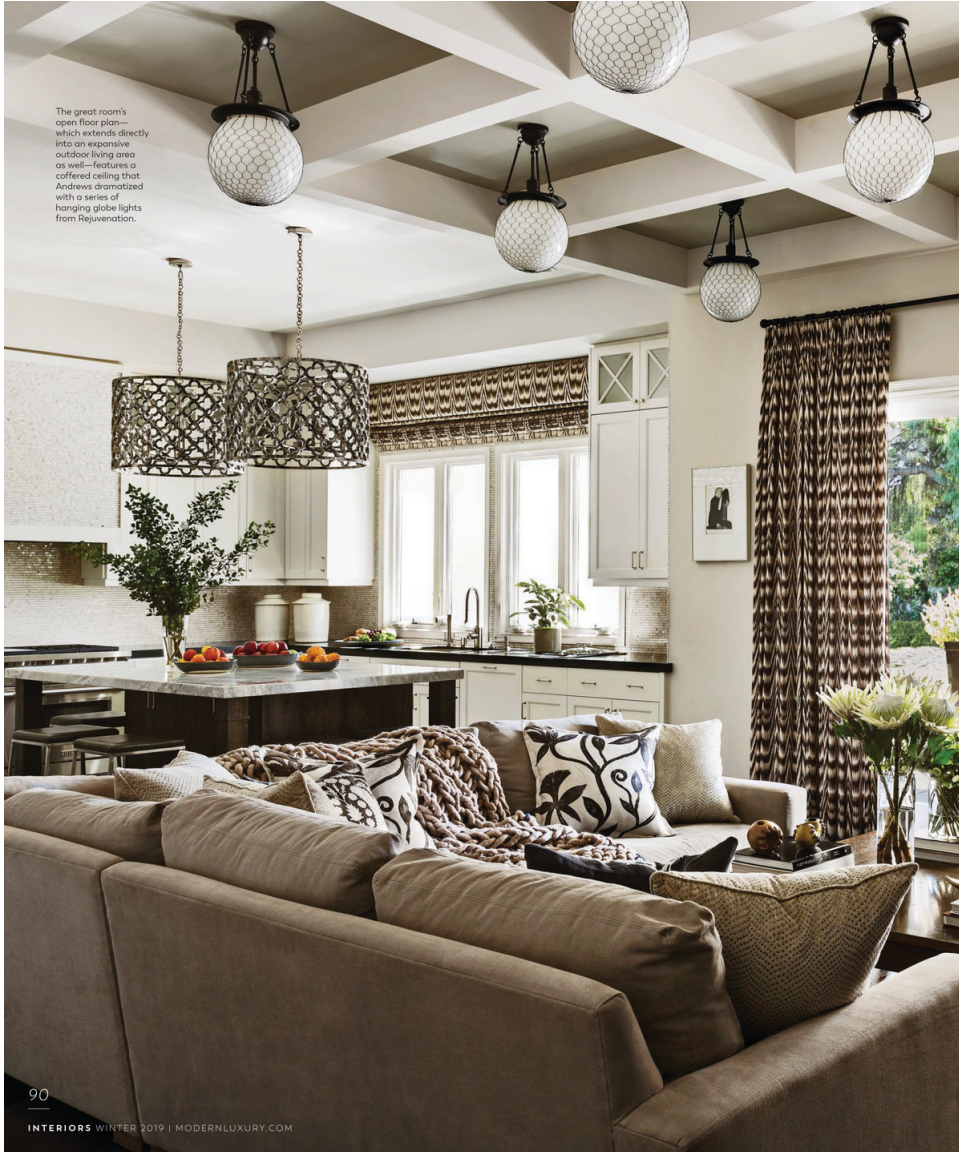
The great room's open floor plan—which extends directly into an expansive outdoor living area as well—features a coffered ceiling that Andrews dramatized with a series of hanging globe lights from Rejuvenation.