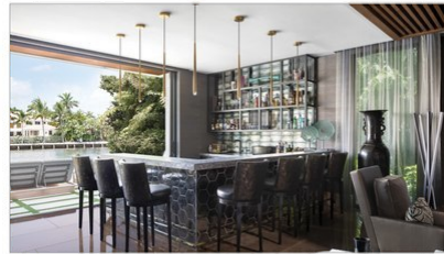
FOR ALL SEASONS (pages 76-85)

INTERIOR DESIGN: Sullivan Design Studio, sullivandesignstudio.com. ARCHITECTURE: Young and Borlik Architects, ybarchitects.com. LANDSCAPE ARCHITECT: Strata Landscape Architecture, strata-inc.com. ENTRANCE HALL: chandelier by Reflex. LIVING ROOM: Calacatta marble slab from Da Vinci Marble; Benjamin Moore paint; Gabriel Scott chandelier from Twentiih; drapes and decorative pillow from De Sousa Hughes; floor lamp by Future Perfect; rug from Stephen Miller Gallery; Hug armchair, sofa, coffee table and side table by Giorgetti. DINING ROOM: sideboard from B&B Italia; table lamp by Kneedler Fauchère; table and chairs from Giorgetti; drapes, Fortuny from Sloan Miyasato; custom rug by Floor Design; Benjamin Moore paint; chandelier by Lindsey Adelman sourced from The Future Perfect. FAMILY ROOM: sectional by Poliform; side table from Minotti; chair and coffee table from Poliform; floor lamp from Roche Bobois. TEA ROOM: rug by Oriental Carpet; sofa, armchair, wine and bar console, tea tray, trolley, tea table, desk, chair, vase, stool and lantern by Chi Wing Lo; winter white paint by Benjamin Moore.