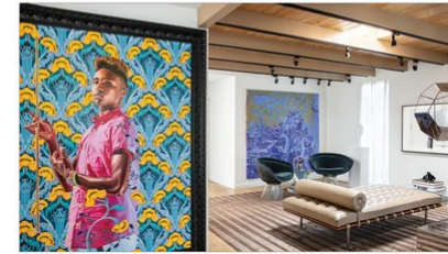
SOLO SHOW (pages 86-95)

MTI; filler from Roht; vanity chair from Interlude Home; cabinetry by Superior Wood Products; custom pendants by Diopri. BAR: barstools from A. Rudin. EXTERIOR: sofa, chairs and cocktail table from Holly Hunt; fabrics from Great Plains, Perennials and Ammon Hixon; dining table from Keltat; chairs from Ethimo; barstools and upstairs terrace chairs from Janus et Cie; rug from Perennials.