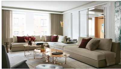
HIGH IMPACT (pages 56-65)