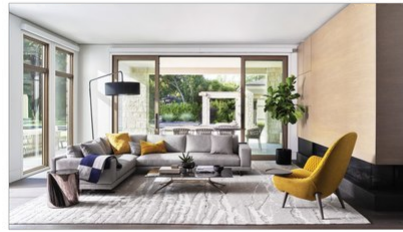
NOW AND ZEN (pages 66-75)