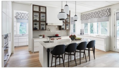
A LIFE OF ADVENTURE (pages 48-55)