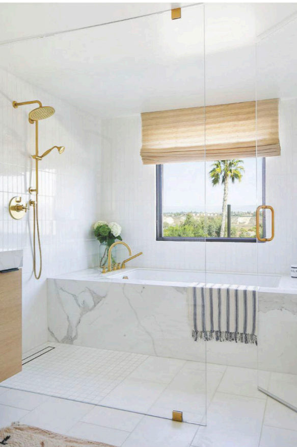
Above: California Faucets fixtures from Pirch stand out against the crisp white finishes in the master bathroom. Enclosed by glass doors, the wet room includes both a tub and shower. Clark had the window treatment by Solé Shades motorized so they can be easily raised and lowered. Right: Cedar & Moss lighting illuminates the dramatic custom bed in the master bedroom. "We wanted to keep it super clean and simple," says Clark. She layered a pair of vintage rugs on the floor for texture and interest.