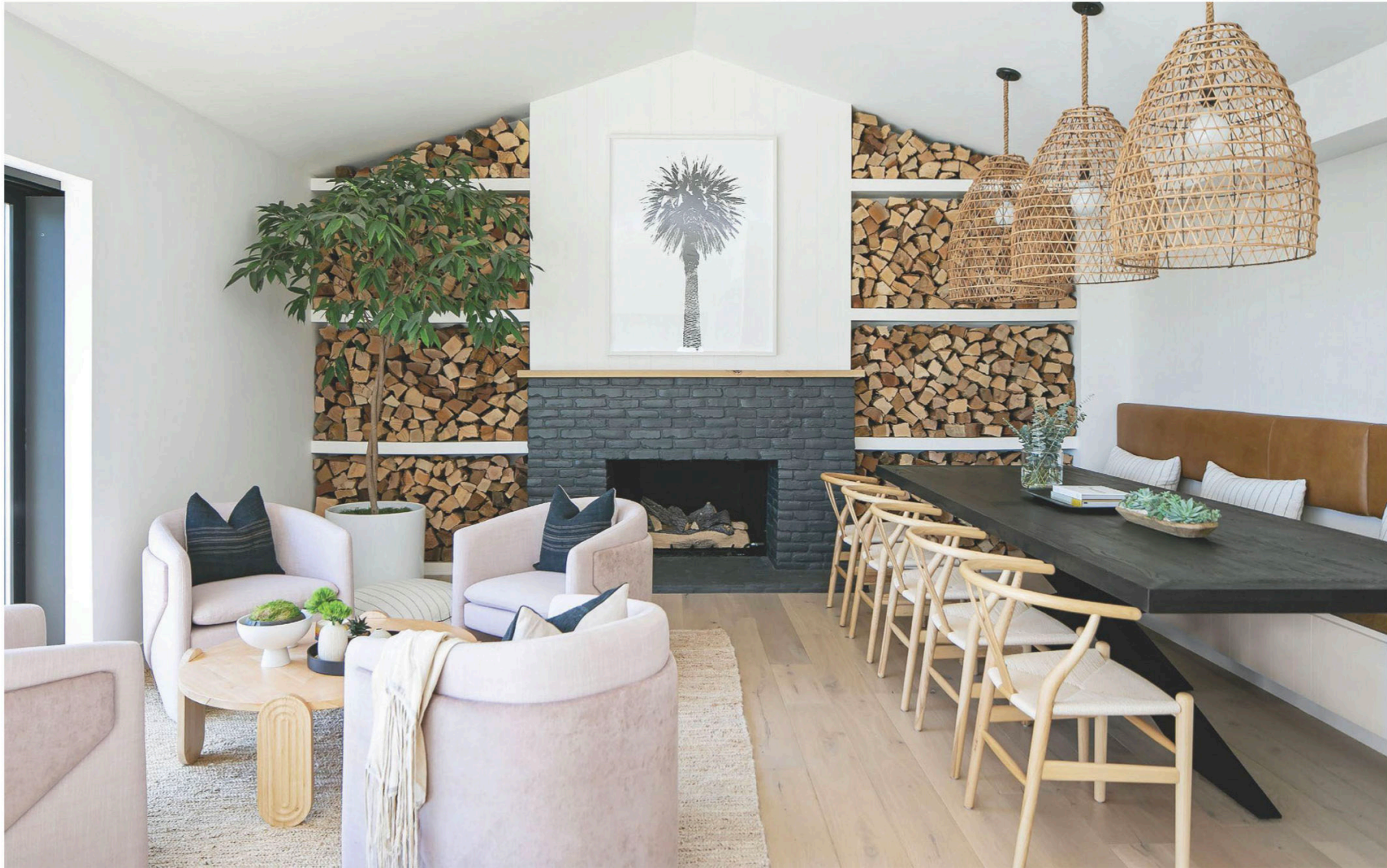
The dining room has both a spot for eating—furnished with chairs and a banquette, an RH dining table and custom pendants—and an adjacent casual zone where the husband can enjoy his morning coffee in one of the West Elm chairs. Artwork from Natural Curiosities hangs above a fireplace painted black to tie into the entry sequence.