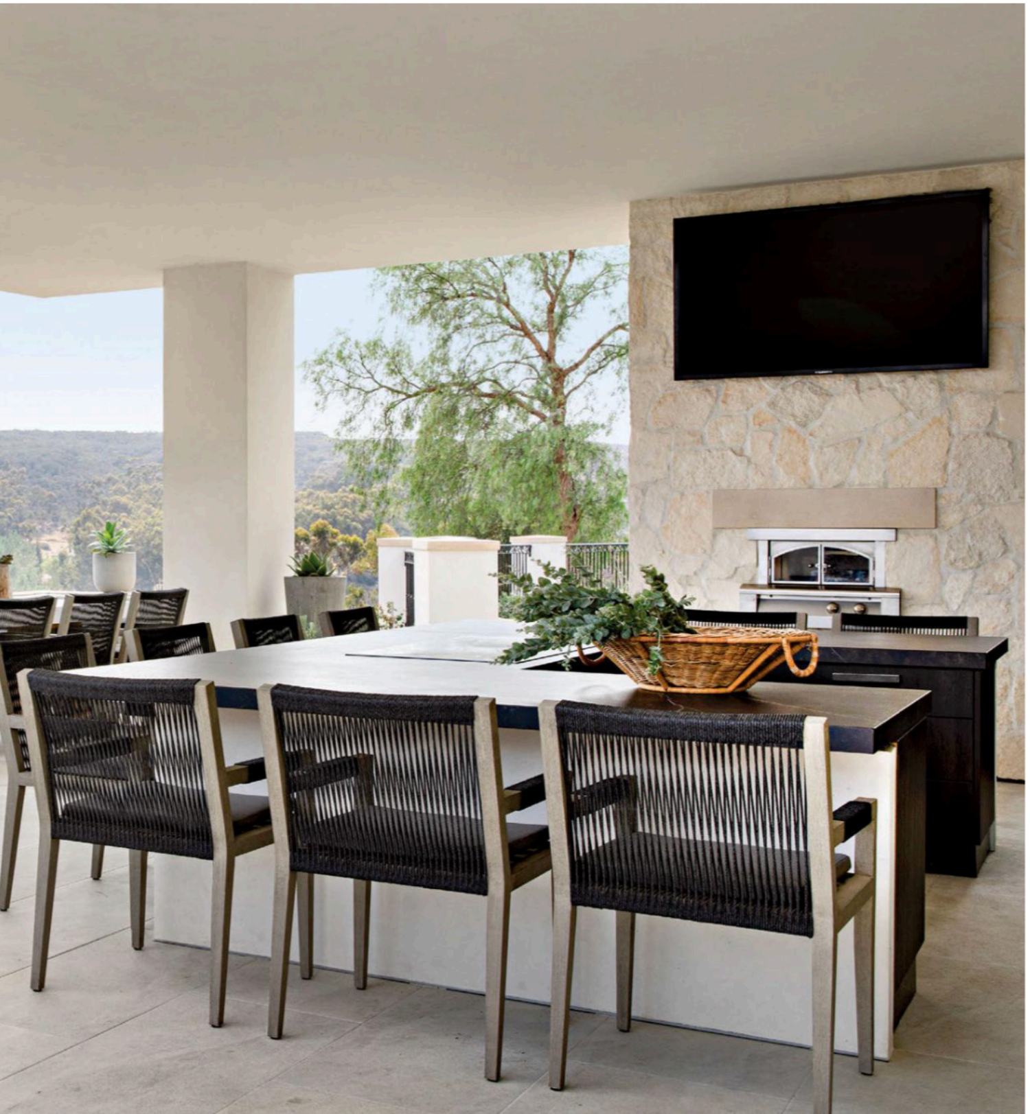
The Lynx outdoor kitchen, with all appliances purchased at Pirch, is equipped with a teppanyaki grill, an Alfresco pizza oven and beer taps. Integrated heaters and plenty of Ili Be Home Collection custom seating make the covered outdoor living space an ideal spot for year-round entertaining.