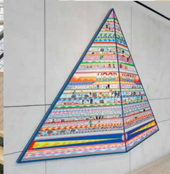
1 Chunks of offices have been removed to make room for trainee bays that have access to windows and light. 2 A lounge area for informal meetings, referred to within the agency as a signing room. 3 The focal point of the building is a staircase that affords views into various areas including listening rooms. Says Martin, co-head of music, West Coast: "I recently had a client come to share new music with me, and he was so concerned he was going to have to do so in a sterile, bright conference room. He was thrilled to discover that the sound and ambience are a perfect way to experience music." Another point of distinction from other agencies: Music is piped in through the offices. 4 Erik Parker's Hood Wink is among the many works, by such artists as Robert Longo, Jen Mann, David Ellis, Jen Stark and Barry McGee, that line the halls. 5 Rottet Studios designed a sculptural reception desk out of highly polished and faceted stainless steel. Says Rottet partner Richard Riveire, "It's a statement that says, 'We're approachable, fun and interesting and we do things slightly differently.'" Adds Gores: "I really wanted for people, the minute they walked in, to feel welcome."